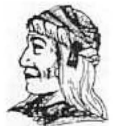
UGWA DEHOLUH YATEHE Because of the help of this Oneida Chief in cementing a friendship between the six nations and the Colony of Pennsylvania, a new nation, the United States was made possible.