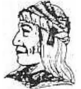
UGWA DEHOLUH YATEHE

Because of the help of this Oneida Chief in cementing a friendship between the six nations and the Colony of Pennsylvania, a new nation, the United States was made possible.