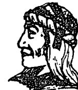
UGWA DEHOLUN YATENE

Because of the help of this Oneida Chief in cementing a friendship between the six nations and the Colony of Pennsylvania, a new nation, the United States was made possible.