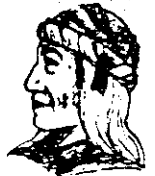
UGWA BEMOLUN YATEHE Because of the help of this Oneida Chief in cementing a friendship between the six nations and the Colony of Pennsylvania, a new nation, the United States was made possible.