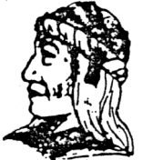
UGWA DEHOLUN YATEHE Because of the help of this Oneida Chief in cementing a friendship between the six nations and the Colony of Pennsylvania, a new nation, the United States was made possible.