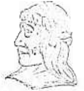
UGWA DENDLOR YATERE Because of the help of this Ononda Chief in cementing a friendship between the six nations and the Colony of Pennsylvania, a new nation, the United States was made possible.