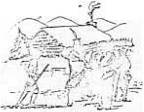
Onondas bringing several hundred bags of corn to Washington's starving army at Valley Forge, after the colonists had consistently refused to aid them.