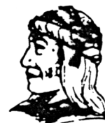
UGWA DEMOLUM YATEHE Because of the help of this Oneida Chief in cementing a friendship between the six nations and the Colony of Pennsylvania a new nation the United States was made possible