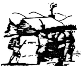
Oneidas bringing several hundred bags of corn to Washington's starving army at Valley Forge after the colonists had consistently refused to aid them