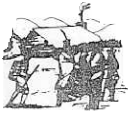
Onedias bringing several hundred bags of corn to Washington's starving army at Valley Forge, after the colonists had consistently refused to aid them