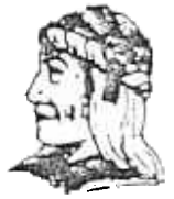
UGWA DEMOLUM YATEHE Because of the help of this Oneida Chief in cementing a friendship between the six nations and the Colony of Pennsylvania, a new nation the United States, was