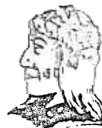
USGS SINGUON TATINE

Because of the help of this Oneida Chief in cementing a friendship between the Oneida nation and the Colony of Pennsylvania, a new nation, the United States was made possible.