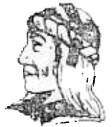
UGWA DEMOLUH YATENE

Because of the help of this Oneida Chief in cementing a friendship between the six nations and the Colony of Pennsylvania, a new nation, the United States was made possible.