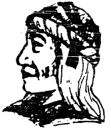
UGWA DEHOLUN YATEHE Because of the help of this Oneida Chief in cementing a friendship between the six nations and the Colony of Pennsylvania, a new nation, the United States was made possible.