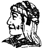
UGWA DEKOLUN YATENE Because of the help of this Oneida Chief in cementing a friendship between the six nations and the Colony of Pennsylvania, a new nation, the United States was made possible.