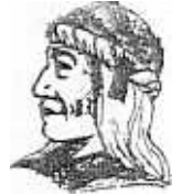
OJWA DEHOLUH YATEHE