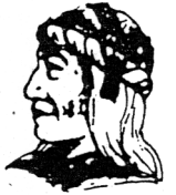
UGWA DEMOLUM YATEHE Because of the help of this Oneida Chief in cementing a friendship between the six nations and the Colony of Pennsylvania, a new nation the United States was