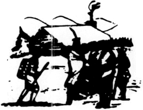
Oneidas bringing several hundred bags of corn to Washington's starving army at Valley Forge, after the colonists had consistently