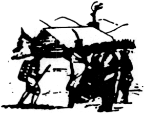
Oneidas bringing several hundred bags of corn to Washington's starving army at Valley Forge. after the colonists had consistently refused to aid them