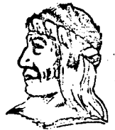
UGWA DEHOLUH YATEHE

Because of the help of this Onondaga Chief in cementing a friendship between the six nations and the Colony of Pennsylvania, a new nation, the United States was made possible.