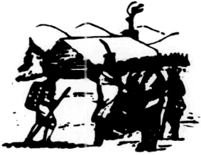
Ojibwas bringing several hundred bags of corn to Washington's starving army at Valley Forge, after the colonists had consistently refused to aid them.