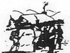
Oneidas bringing several hundred bags of corn to Washington's starving army at Valley Forge after the colonists had consistently