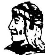
JGWA DEMOLUJ MATEHE Because of the help of this Oneida Chief in cementing a friendship between the Six Nations and the Colony of Pennsylvania a new nation for the United States was