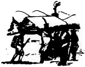
Oneidas bringing several hundred bags of corn to Washington's starving army at Valley Forge. after the colonists had consistently refused to aid them