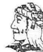
USWA DENOLUH SATI Because of the I of this Oneida C in cementing a frie ship between the nations and the Col of Pennsylvania, a i nation, the U n i t Status was made s sible.