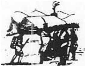
Oneidas bringing several hundred bags of corn to Washington's starving army at Valley Forge. after the colonists had consistently refused to aid them