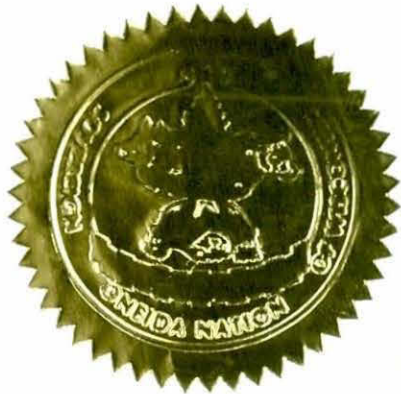
Seal of the Sovereign Oneida Nation

Signed this 10 th day of July , 19 96 by