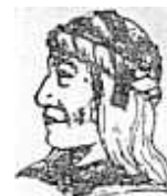
USWA DEHOLUN YATENE Because of the help of this Oneida Chief in cementing a friendship between the six nations and the Colony of Pennsylvania, a new nation, the United States was made possible.