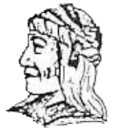
UGWA DEHOLUN YATENE Because of the help of this Oneida Chief in cementing a friendship between the six nations and the Colony of Pennsylvania, a new nation, the United States was made possible.