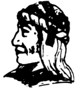
UGWA DEMOLUM YATEHE Because of the help of this Oneida Chief in cementing a friendship between the six nations and the Colony of Pennsylvania, a new nation, the United States, was