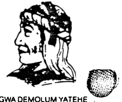
UGWA DEMOLUM YATEHE Because of the help of this Oneida Chief in cementing

six nations and the Colony of Pennsylvania, a new na- tion, the United States, was made possible