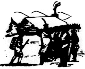
Oneidas bringing several hundred bags of corn to Washington's starving army at Valley Forge, after the colonists had consistently refused to aid them.