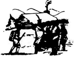
Oneidas bringing several hundred bags of corn to Washington's starving army at Valley Forge. After the colonists had consistently refused to aid them