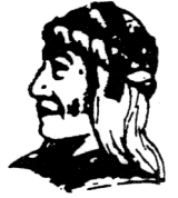
UGWA DEMOLUM YATEHE Because of the help of this Oneida Chief in cementing a friendship between the six nations and the Colony of Pennsylvania, a new nation, the United States, was