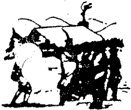
Oneidas bringing several hundred bags of corn to Washington's starving army at Valley Forge after the colonists had consistently refused to aid them.