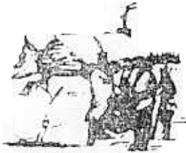
Oneidas bringing several hundred bags of corn to Washington's starving army at Valley Forge, after the colonists had consistently refused to aid them.