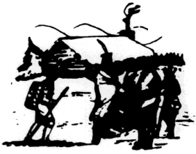
Oneidas bringing several hundred bags of corn to Washington's starving army at Valley Forge, after the colonists had consistently refused to aid them.