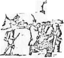
Oneidas bringing several hundred boys of corn to Washington's starving army at Valley Forge, after the colonists had consistently refused to aid them.