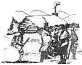
Onondas bringing several hundred bags of corn to Washington's starving army at Valley Forge, after the colonists had consistently refused to aid them.