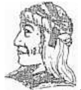
UGWA BEKOLUH YATE Because of the help of this Oneida Chief in cementing a friendship between the six nations and the Colony of Pennsylvania, a new nation, the United States was made possible.