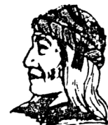
UBWA DEMOLUN YATEME