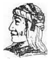
UGWA DEMOLUX YATENE Because of the help of this Oneida Chief in cementing a friendship between the six nations and the Colony of Pennsylvania, a new nation, the United States was made possible.