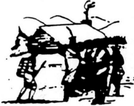
Oneidas bringing several hundred bags of corn to Washington's starving army at Valley Forge, after the colonists had consistently refused to aid them.