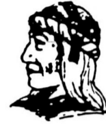
UGWA DEMOLUM YATEHE Because of the help of this Oneida Chief in cementing a friendship between the six nations and the Colony of Pennsylvania, a new nation the United States was made possible.