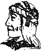
USWA DEMOLUN TATEWE Because of the help of this Oneida Chief in cementing a friendship between the Six Nations and the Colon of Pennsylvania, a new nation, the United States was made possible.